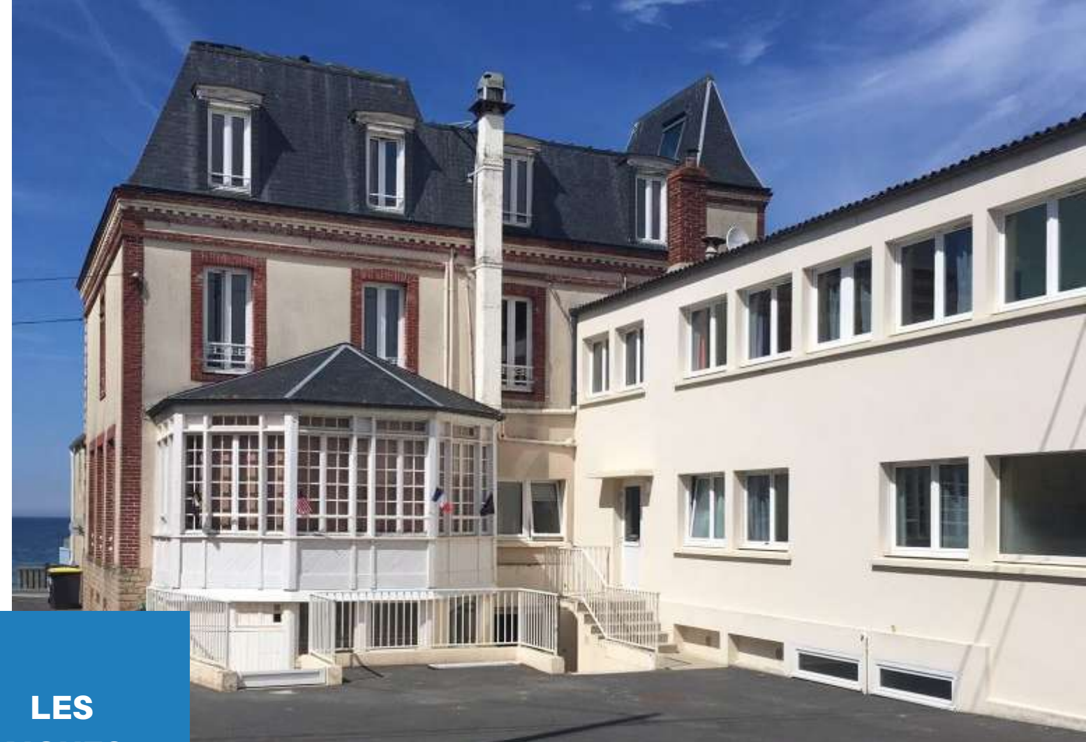
LES AIGUES MARINES