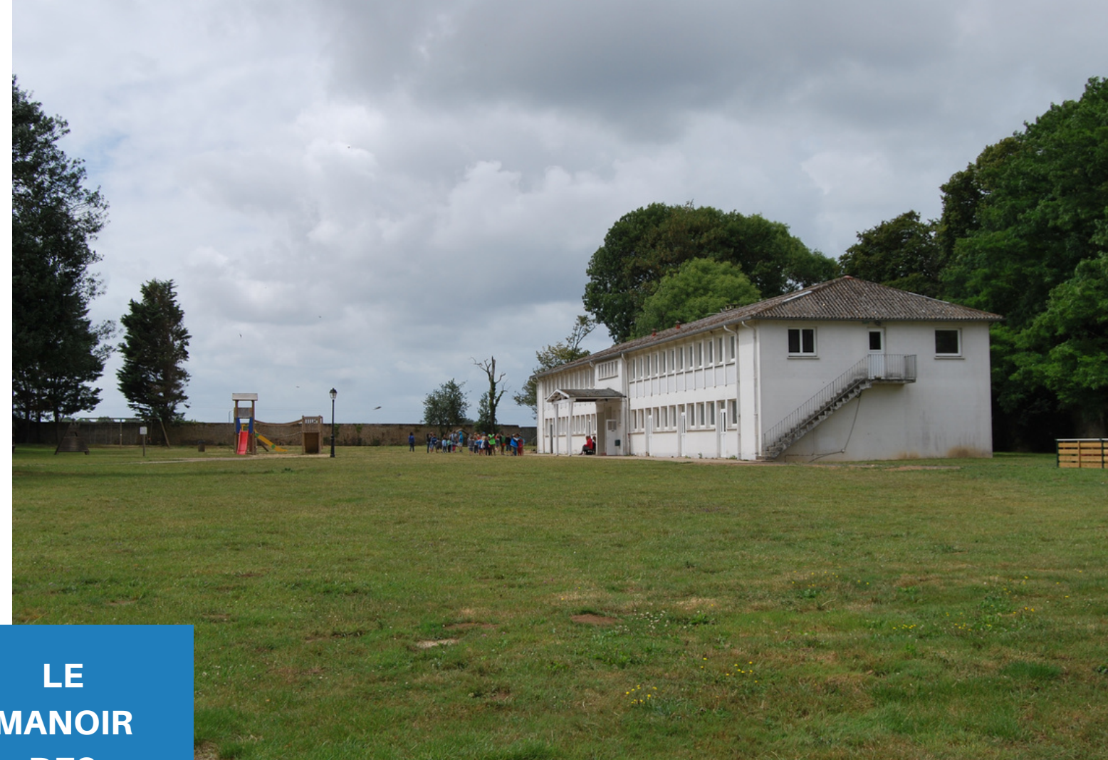
LE MANOIR DES HAUTS TILLEULS